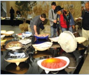
Viewers at the exhibit