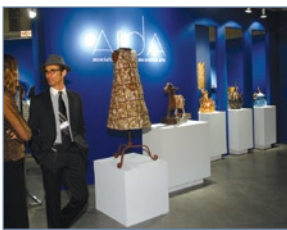
AIDA artists on opening night