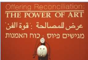
Entrance to the "Offering Reconciliation" exhibit