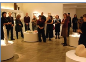
Opening night of "Yofi"